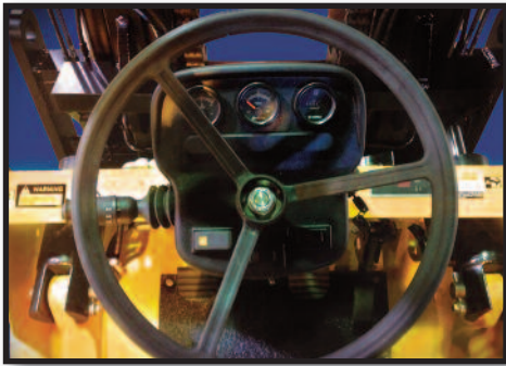
STEER COLUMN: Self contained, fully adjustable, tilt and telescopic steer column.