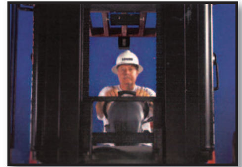
LOWRY'S: Unique super "Clear View" mast combines excellent visibility with exceptional strength for safety and high productivity.